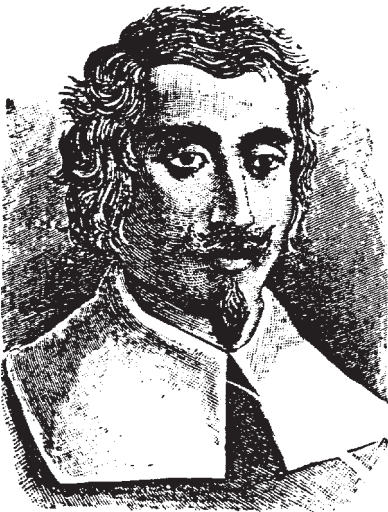
Fig. 1: Evangelista Torricelli (1608 - 1647)

As manufacturers of all types of flow regulating device, we often face the question "How does one control the discharge reliably with low flows on combined sewer overflows (CSOs) and combined sewer overflow tanks (CSO-tanks)?" The background for the question, are often small catchment areas or new building areas which are to get a new storm water treatment facility. If the rain reservoir is sized according to ATV-worksheet A 128 /1/, under average